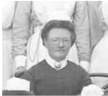
Image from: "Domestic Comforts They had none", by David Lloyd, pub. 2003 by Aust. Scholarly Publishing Pty Ltd, page 71.

The Encyclopaedia of Women & leadership in twentieth-century Australia