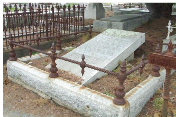
The grave of Paul Howard MacGILLIVRAY

Will & Estate: http://trove.nla.gov.au/news/paper/article/9370815/303101