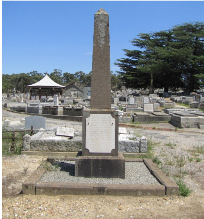
Notes for the CAHILL family grave, Grave #2885 in section G4

This grave, with its Sandstone Obelisk, was part of the Galatea Tragedy in 1867, which saw the death of three young boys caught, in a fire aboard the float Galatea.